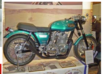
No awards, but this nice update of a Triumph T160 showed what could have been with more development.