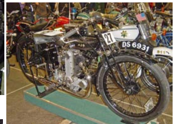
1927 AJS K7, second in the Vintage class