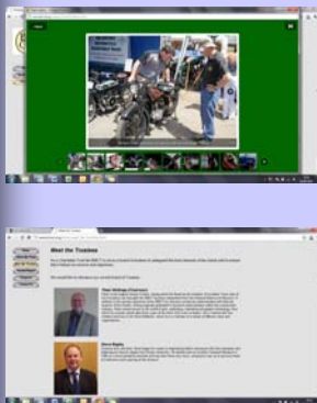
Screenshots from the new site:

and a message board where BMCT members and the general public can exchange views and information on anything to do with British bikes. Check it all out now at www.bmct.org