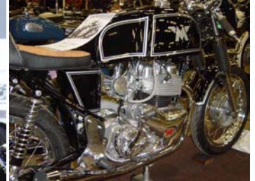
This 1959 Matchless G9 Café Racer won Best Classic Special