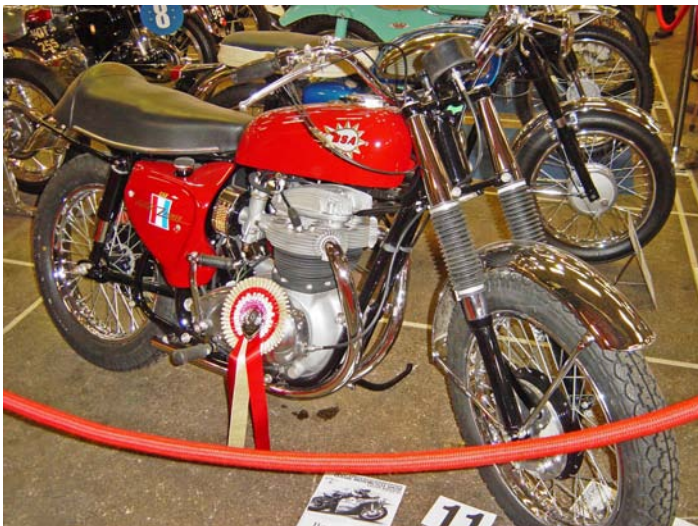
The BSA Hornet voted Best in Show at Stafford. Complete with compulsory oil leak!