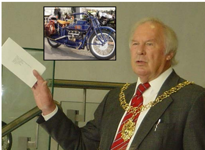
The Lord Mayor with the letter carried to Brighton on the 1920 Henderson (inset). Not everyone got away without last minute adjustments, this Vincent rider (right) had the spanners out.