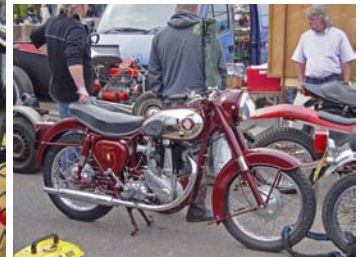
Outside in the Autojumble this tidy BSA B33 was looking for a new home at £4,250